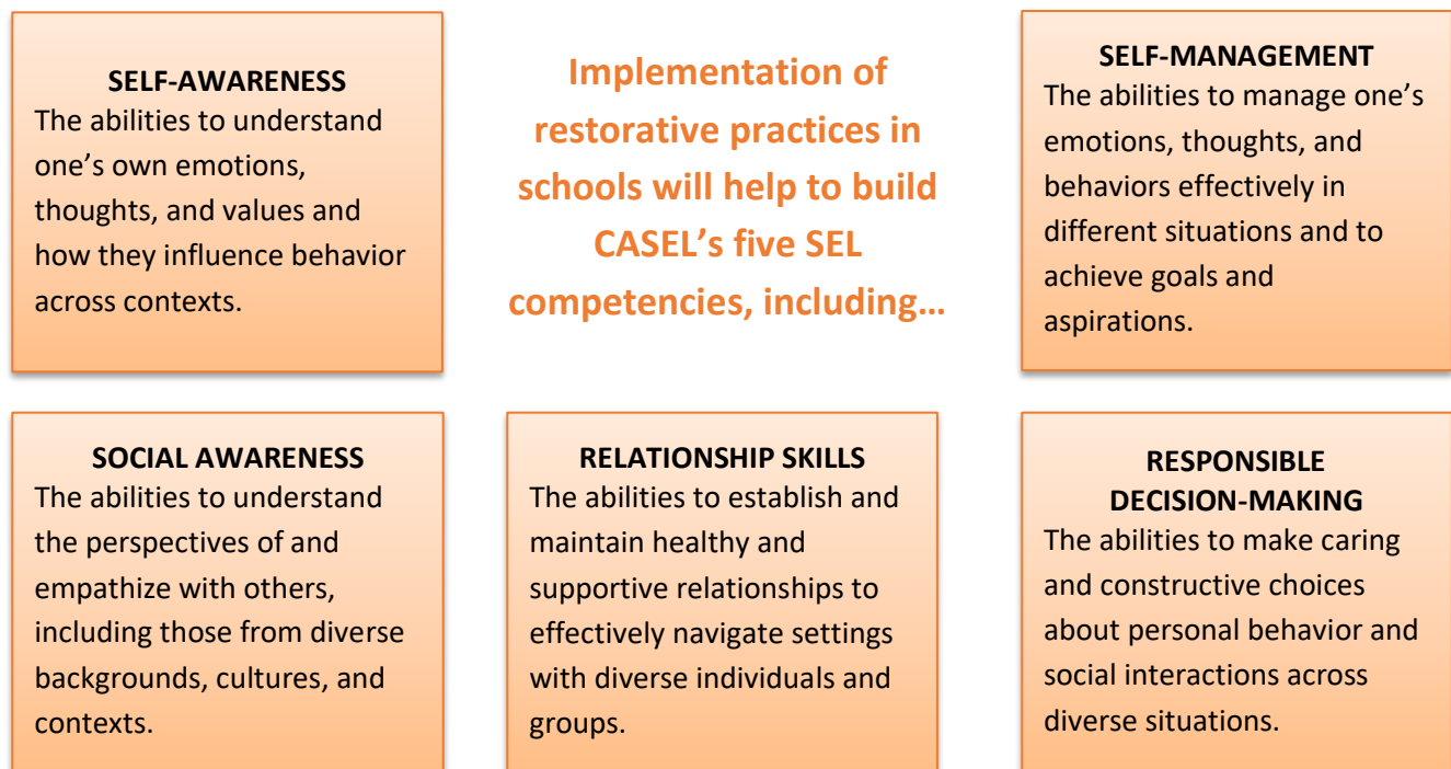
Alignment of Restorative Practices and the CASEL SEL Competencies for Adults and Students

How restorative practices support the development of all five SEL competencies can best be illustrated by examining the following three major RP techniques: affective language , circles , and responses to harm through conversations and conferences . For greatest impact on students’ SEL development, these techniques are most effective when aligned with schools’ evidence-based SEL programs and practices, implemented together, and used frequently and consistently by all members of the school community.