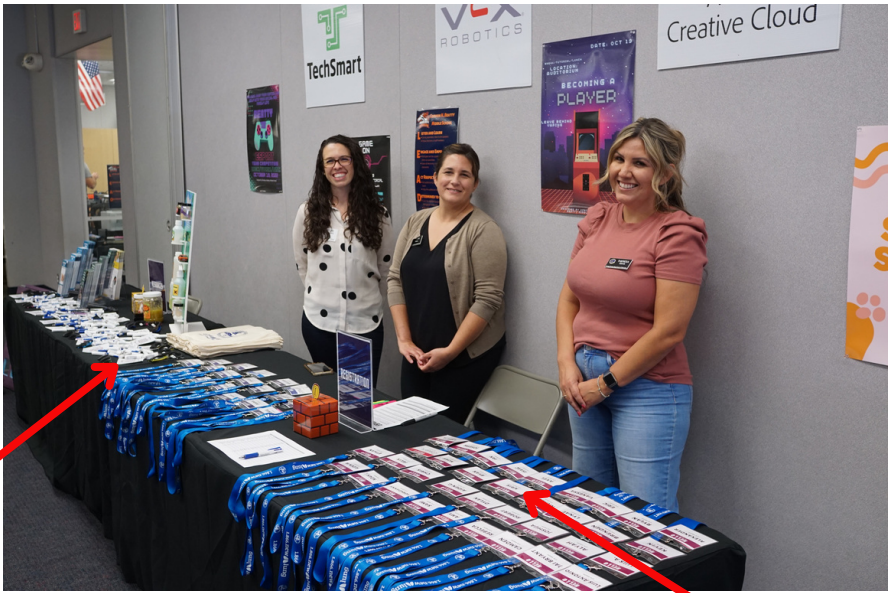
TUPE Resource Table with instructional Materials and giveaways