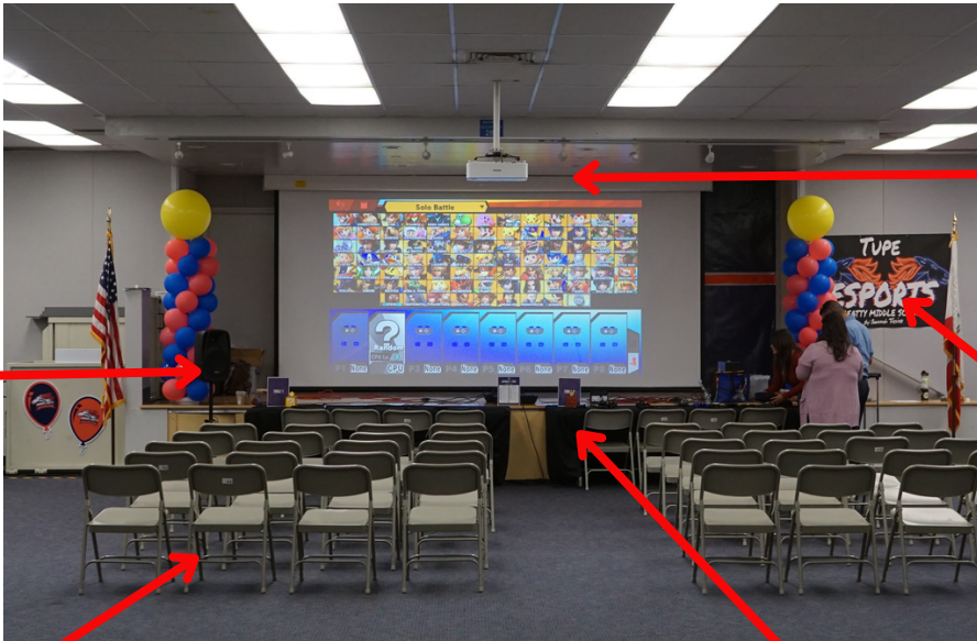
Projector and Screen