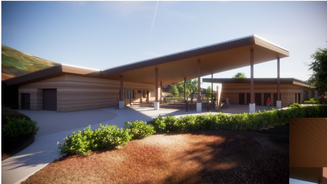
ADMIN BUILDING/OUTDOOR DINING (SOUTHWEST VIEW)