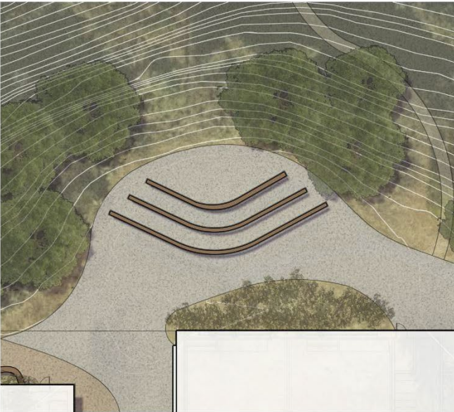
Capacity : 125 people