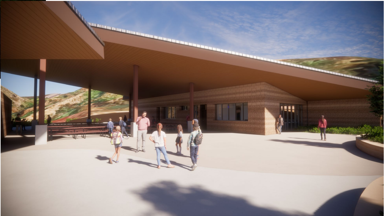
ADMIN BUILDING/OUTDOOR DINING (EAST VIEW)