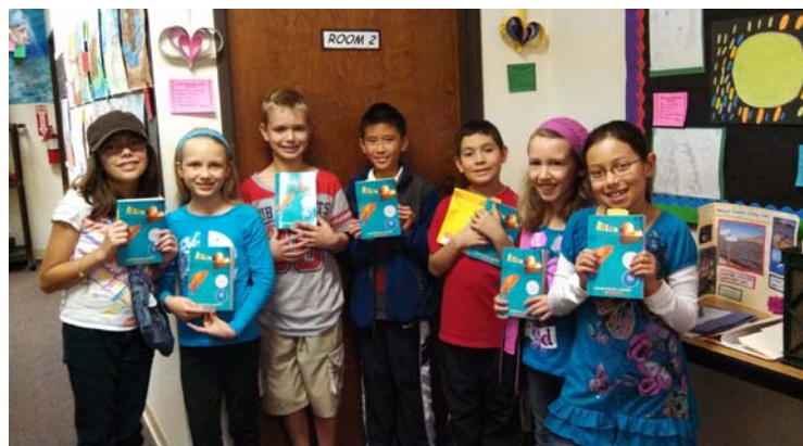
4 th Grade Block Class

Contact paraeducators at 714-245-6470 to sign