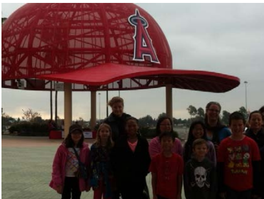
Orange County History Day

For a more in-depth description of CIMI activities and information, visit their website at www.guidediscoveries.org/cimifoxlanding.html