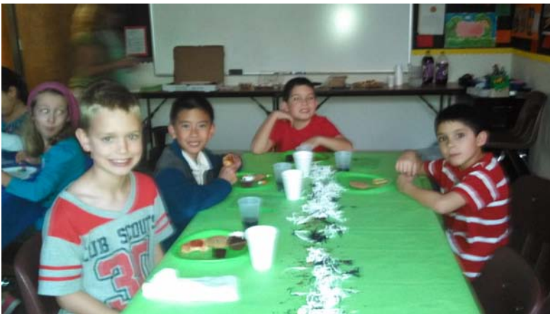
4 th Graders read "Rules" and celebrate after reading.

Contact paraeducators at 714-245-6480 to sign up.