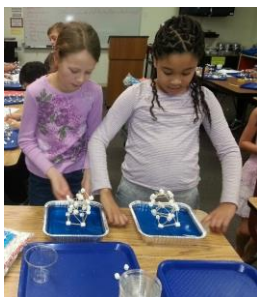
Earthquake in the classroom lab