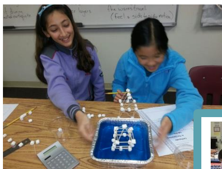
3 rd & 4 th grade class

Let's try to reach $600.00 this year! Keep saving those Boxtops for a chance to win the GRAND PRIZE of $50.00. Please put your Boxtops in a baggie or small envelope, write your name on the outside and drop it in the container at the front desk. Ready, Set . . . SAVE!!