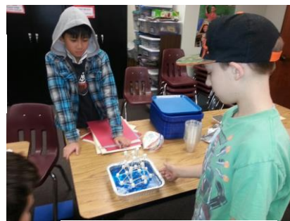
5 th & 6 th grade class