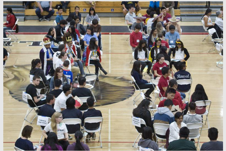
The exciting live-audience Super Quiz Relay then and now! Left: 1973, Bolsa Grande High School. Right: 2016, Westminster High School.