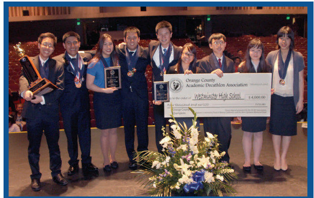
The Westminster High School Academic Decathlon team proudly displays awards and $4,000 travel stipend.

For this complete article and more stories from the Orange County Department of Education, please visit the new OCDE Newsroom page at http://newsroom.ocde.us