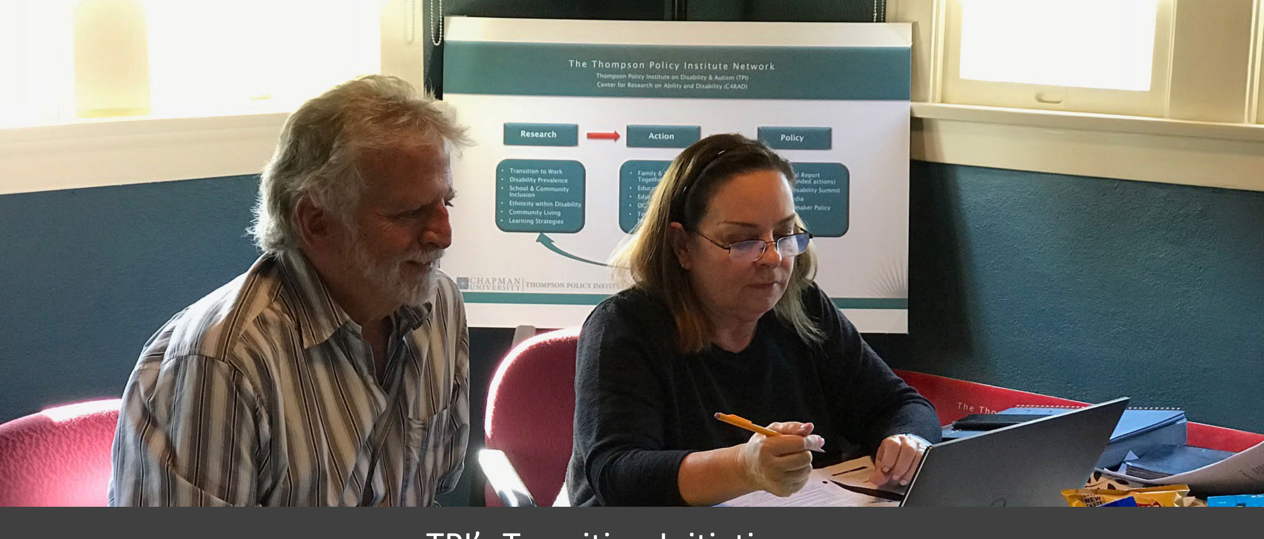
TPI's Transition Initiatives Transition from School to Quality Adult Life