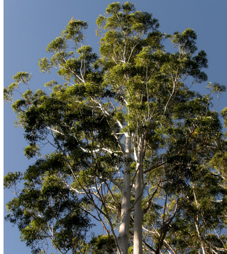
Blue Gum Eucalyptus ( Eucalyptus globulus )