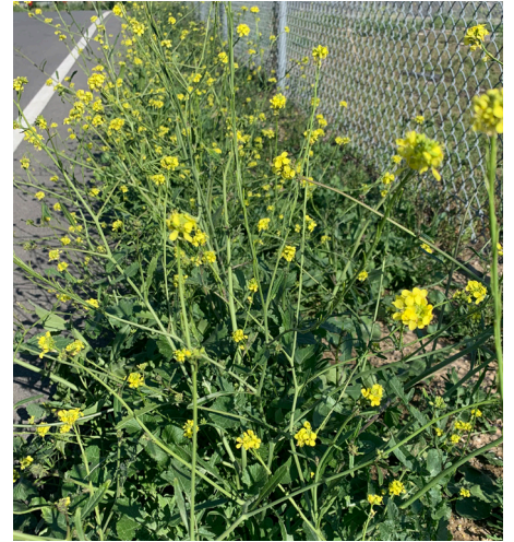
Black Mustard ( Brassica nigra )