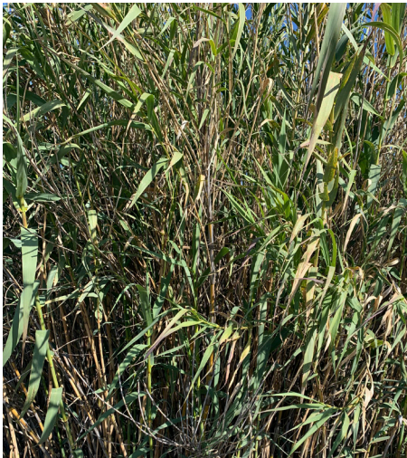
Arundo ( Arundo donax )