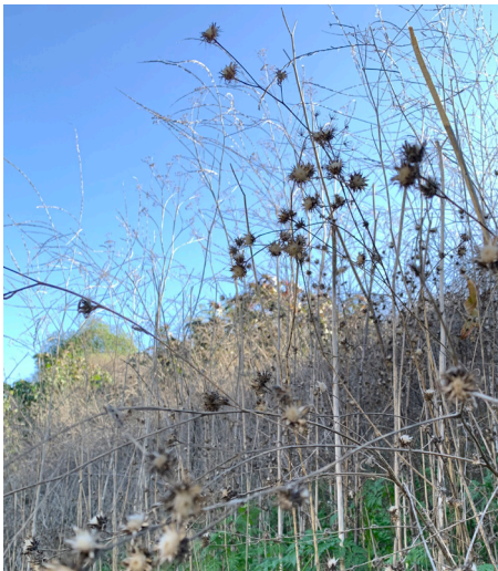
Star Thistle ( Centaurea solstitialis )