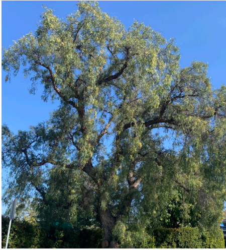
Brazilian Pepper Tree ( Schinus terebinthifolia )