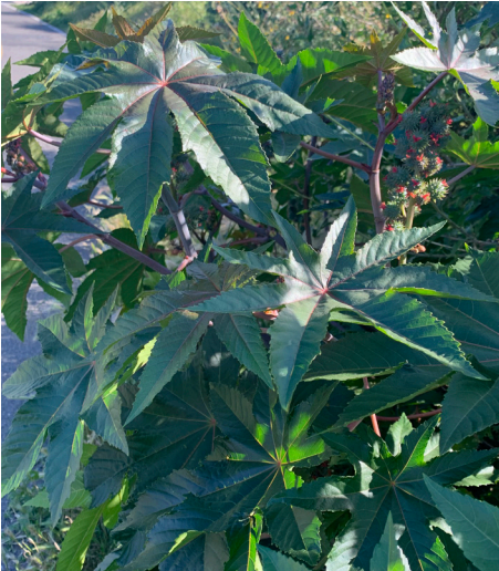
Castor Bean ( Ricinus communis )