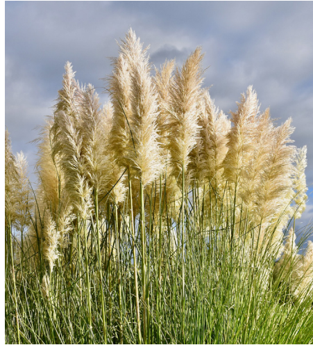
Pampas Grass ( Cortaderia selloana )